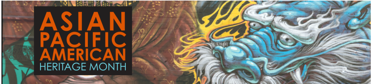
Detail of "Chinatown, San Francisco, California".

The San Ysidro School District is blessed to have many cultures and ethnicities in our district family. We celebrate each and every one of them for the richness and diversity that they bring to our schools and community. Here is a link to the Asian Pacific Heritage.gov site, hosted by The Library of Congress, with information and activities for teachers and parents to help celebrate Asian American Pacific Islander Heritage Month.